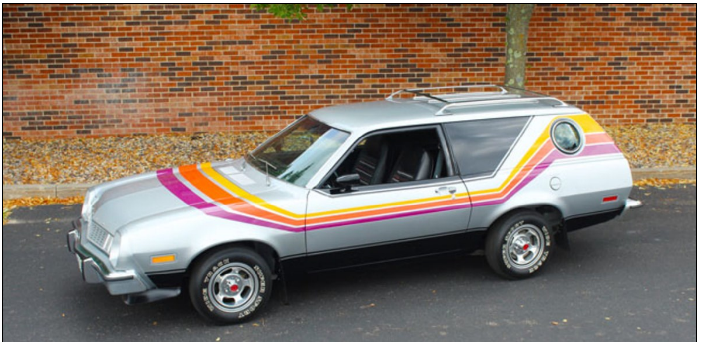
1977 Ford Pinto Cruising Wagon Deluxe Edition