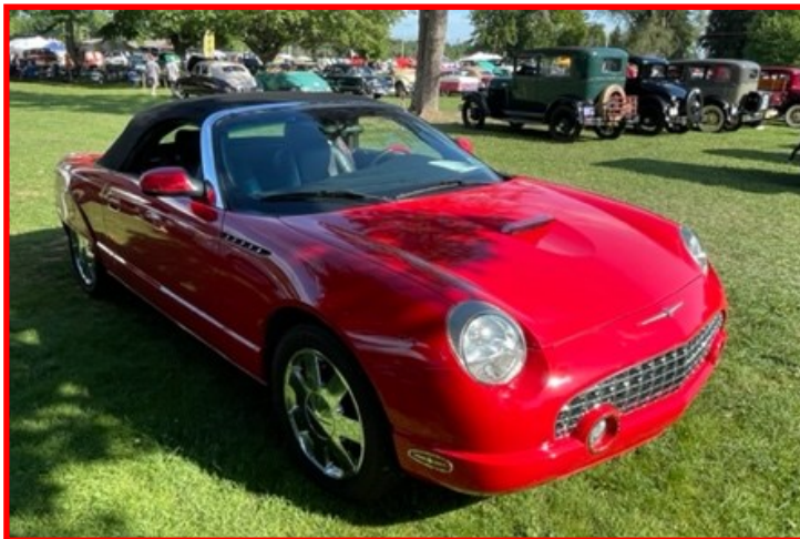
Tom Hollenbach also attended the show with his Thunderbird. I had to use a different photo because one I actually took did not come out clearly.