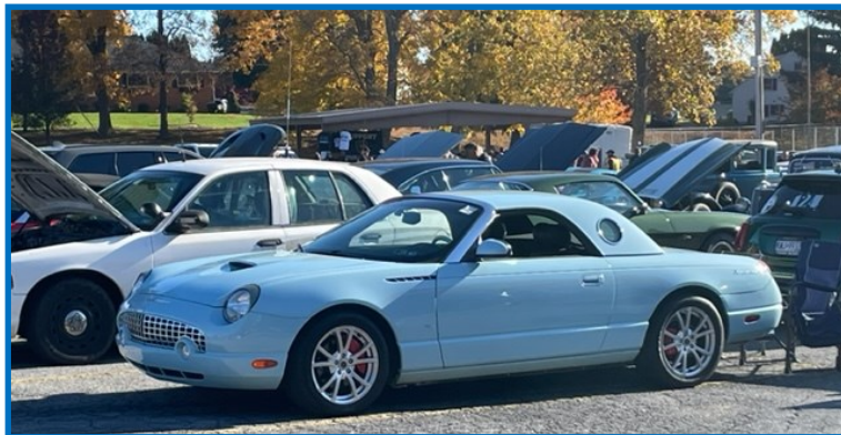
YES ! My T-Bird finally made it to Nazareth Boro Park for a Car Show!