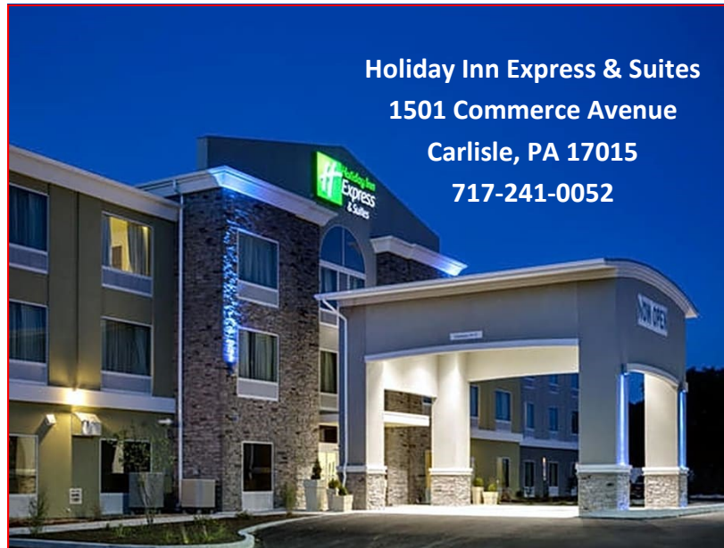
Holiday Inn Express & Suites 1501 Commerce Avenue Carlisle, PA 17015 717-241-0052

As we have been mentioning in previous newsletters, a reunion of Thunderbird friends is being planned in conjunction with the 2024 Carlisle All Ford National. We secured a block of rooms in the Carlisle area for the nights of Friday, May 31 through Sunday June 1, 2024. This allows for the group being together for the evening, for breakfast, etc.... We have 25 rooms held and the number can be increased based on demand. The rate is $185.00 per night, which is discounted from the standard rate. Room reservations can be cancelled up to 6:00 pm the night of the reservation. The rate includes a breakfast and other amenities. We will also have use of a meeting room as a hospitality room.